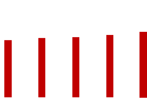
Enrollment by Gender and Ethnicity

Source: EAS Portal; VSU SRA Analysis, May 2010.